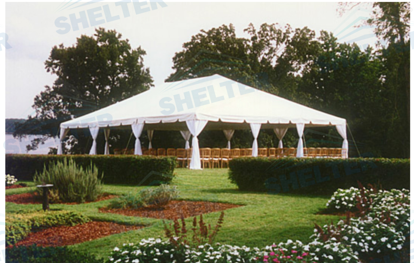
Festival & Celebration